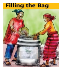
Filling the Bag