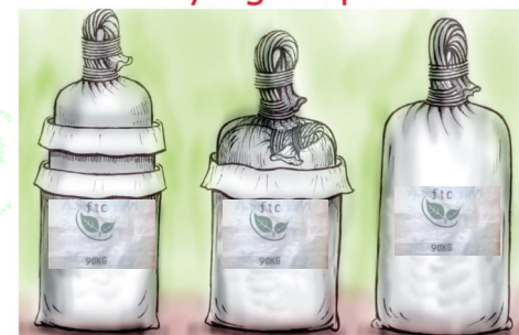
Step 1 Inner bag first Step 2 Middle bag next Step 3 Outer bag last